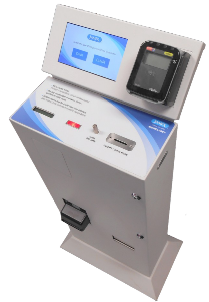
9557-JPC MobilePay Netpad